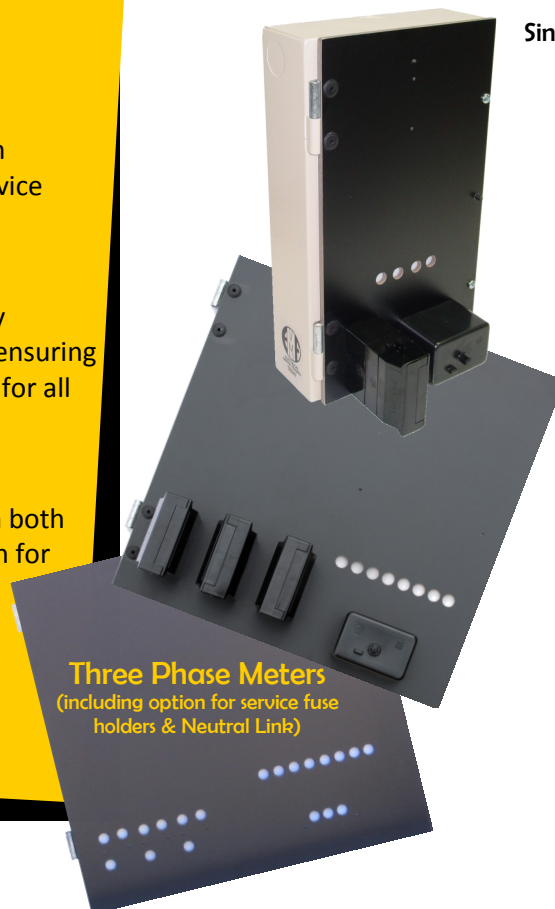
Three Phase Meters (including option for service fuse holders & Neutral Link)