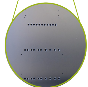
CT Metering Panels